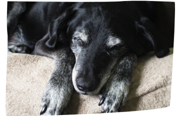
MLS® for Elderly patients September 16, 2024 7:00 PM (CEST)