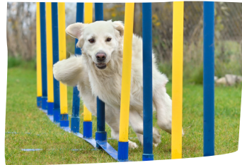
MLS® for Sport dogs May 13, 2024 7:00 PM (CEST)