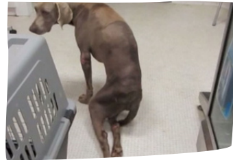
MLS® for Neurological conditions June 17, 2024 7:00 PM (CEST)